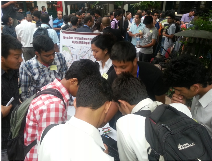
Figure 1: A crowded OSM booth during a Tech Mash-Up event in Kathmandu. The team tried to create awareness of OSM effort with the goal of building a larger Nepal OSM community.

New York City, with all groups working together to digitize building footprints in the Kathmandu Valley. To help build capacity within the tech communities of Kathmandu to work with OSM data, the project organized a Developers' Meetup that was attended by over 50 people and featured presentations and trainings on topics such as interacting with the OSM API, approaches for incorporating OSM into mobile applications and software for creating web mapping tools using OSM data.