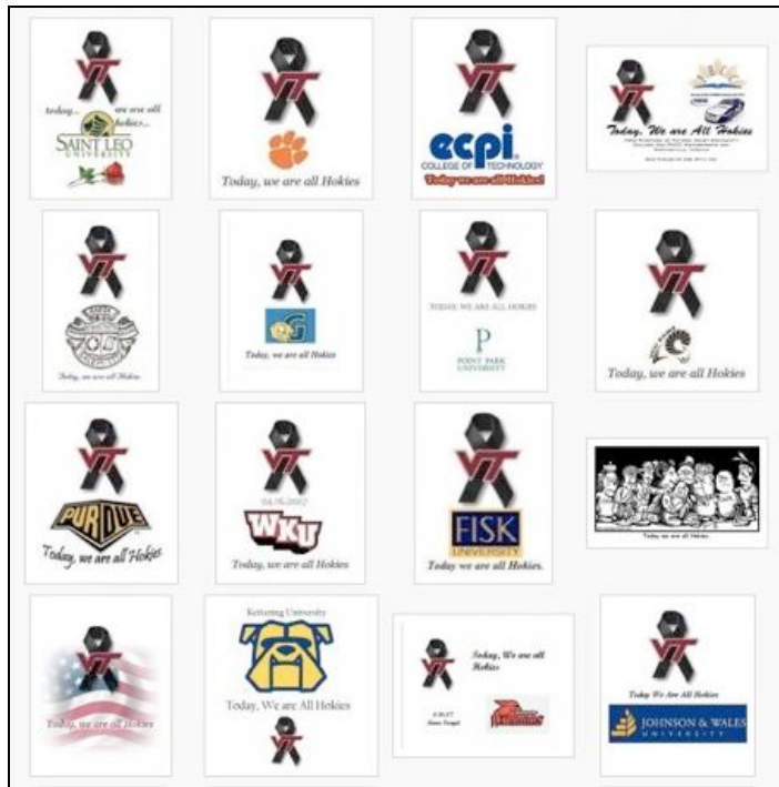
Figure 2. Symbols of support seen in Facebook.

In Facebook, people changed their user picture to an iconic representation of Virginia Tech, including what became the standardized VT memorial ribbon (see Figure 2). Other members created images with their own collegiate mascot or symbol juxtaposed with a VT memorial ribbon. The phrase "Today, we are all Hokies!" was also used in many of these images to signal support.