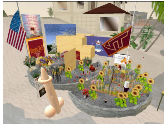
Figure 4. SecondLife virtual memorial for the victims of the Virginia Tech tragedy