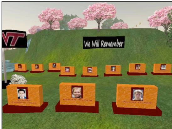
Figure 3. SecondLife virtual graveyard for the victims of the Virginia Tech tragedy

with gravestones for each of the fatality victims with names, photos, and short biographies for each one (see Figure 3). Other users created virtual memorials that included candles, poetry, music, and flowers, all simulations of the same kind of objects placed at the physical memorial sites on the Virginia Tech campus (see Figure 4).