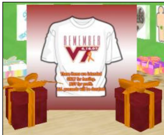
Figure 5. SecondLife T-Shirt Being Sold to Benefit the Victims of the Virginia Tech Tragedy.

Others take advantage of disaster as an opportunity to profit by selling products and services. For example, vendors in SecondLife sold t-shirts that commemorated the victims of the Virginia Tech Shooting (see Figure 5). In cases like this one, vendors often claim that proceeds go to help the victims, but it is often unclear how much really goes to the victims or relief activities.